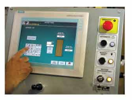
User Friendly Interface